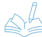
PROCESS DESIGN & DOCUMENTATION