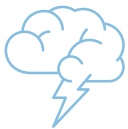
BRAINSTORMING & IDEATION

MindManager complements your workday to synthesize that information, boost your productivity, empower your plans & projects, and collaborate & communicate more effectively.