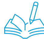
PROCESS DESIGN & DOCUMENTATION